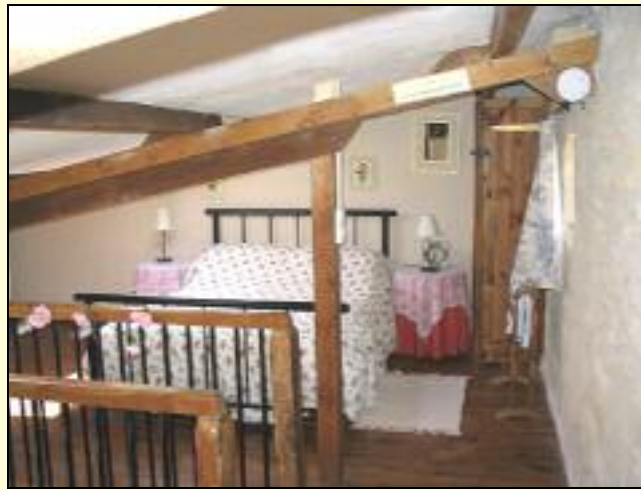
Lys's romantic bedroom