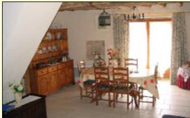
The dining room has a large table and dresser

The huge lounge has a comfortable lounge suite and bed Settee, T.V, HiFi, Videos, DVD, Cd's, Books and Games.