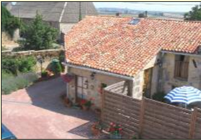
A View of one of Soleil's entrances

Les Fleurs comprises three gites in a sunny secluded courtyard. Each gite has its own garden or patio complete with garden furniture and bbq.