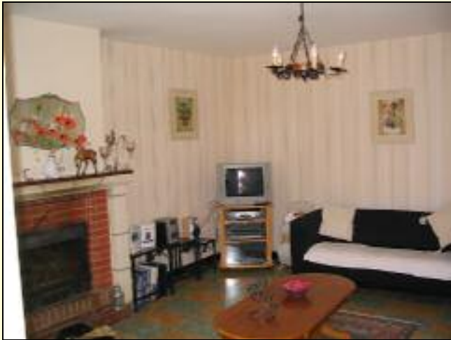
Anjou's comfortable lounge with wood burning fire