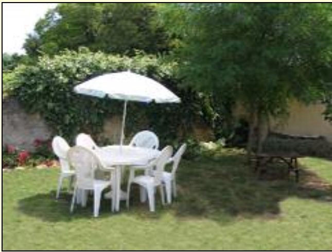
Anjou's spacious private garden