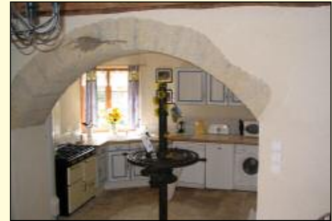
Soleil's fully equipped Kitchen

The kitchen is fully fitted and has a large range style 8 ring cooker with 2 ovens and grill, Dishwasher, Microwave, Washing Machine and Fridge.